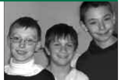
Cedarcrest students celebrated All Saints Day, November 1, by dressing up as their favorite saint.